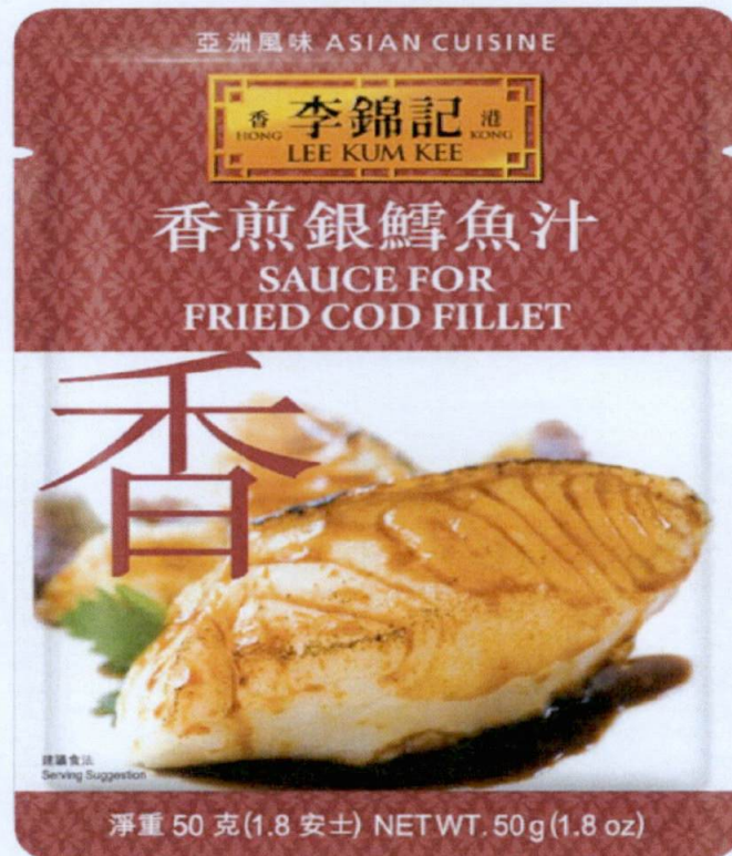
Figure 1. Unregistered LEE KUM KEE Sauce for Fried Cod Fillet

The Food and Drug Administration (FDA) warns all healthcare professionals and the general public NOT TO PURCHASE AND CONSUME the unregistered food product: